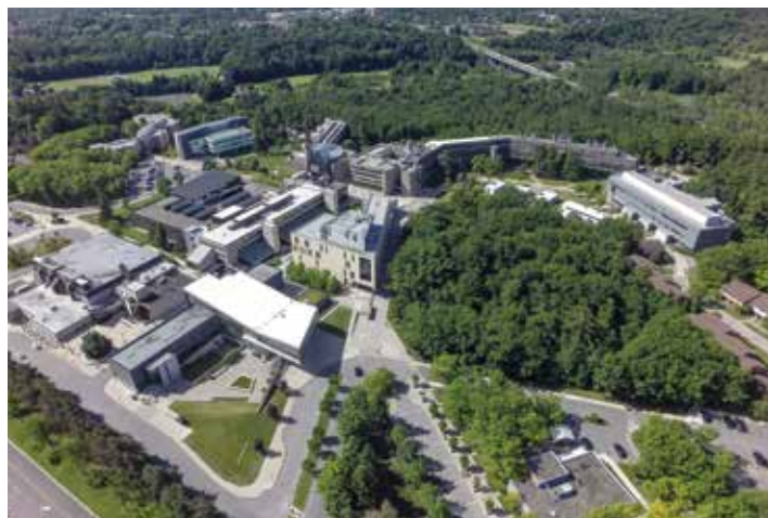
University of Toronto Scarborough (UTSC)