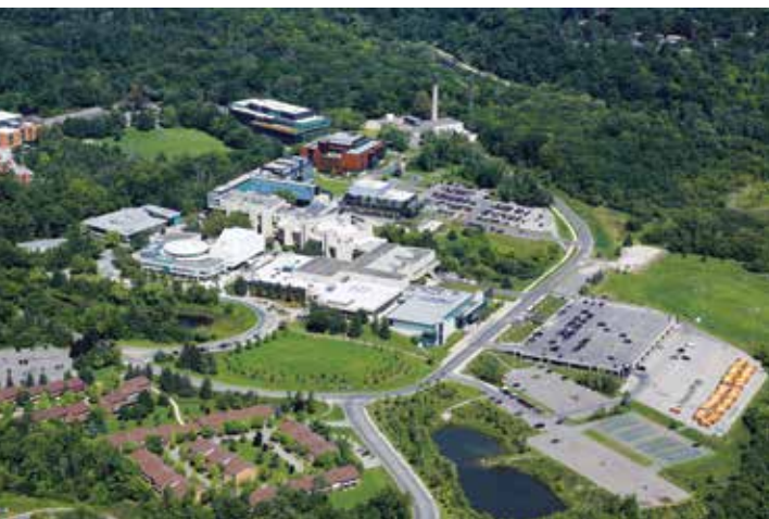
University of Toronto Mississauga (UTM)

For more information visit the ITS website at http://main.its.utoronto.ca/about/strategic-plan or contact the CIO directly at cio.office@utoronto.ca .