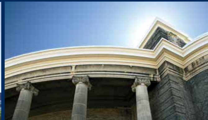
University of Toronto St. George (UTSG)