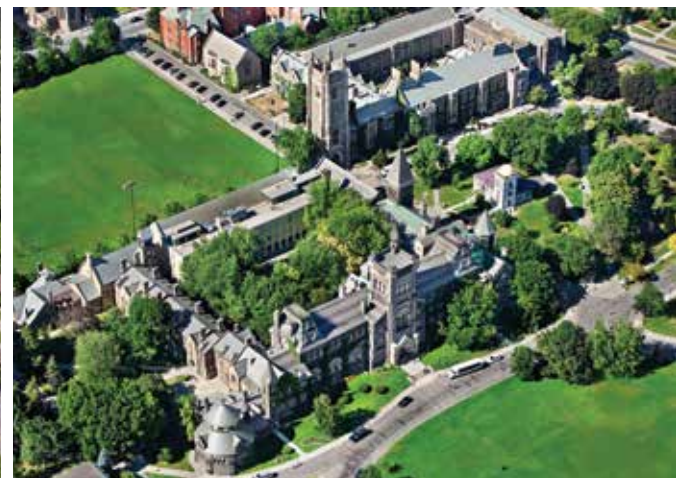
University of Toronto St. George (UTSG)