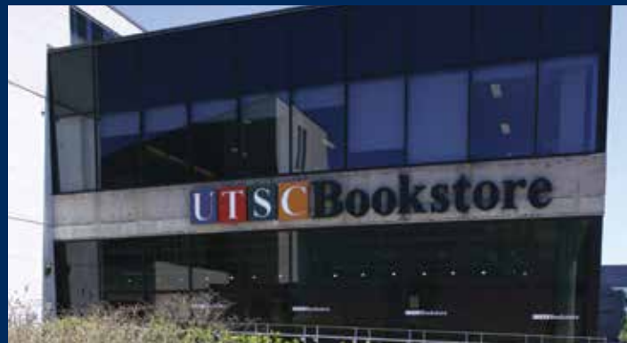
University of Toronto Scarborough (UTSC)